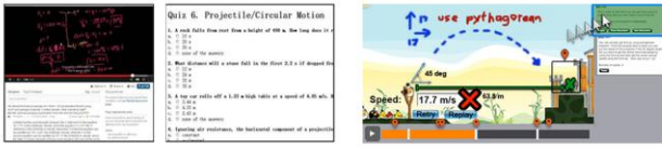
Figure 2: Current video-based learning environments visually separate the video, comments, and assessments (left). L.I.V.E tightly integrates the three components (right).

questions. This may be less ideal as Constructivism suggests that it is beneficial to allow learners to explore and access relevant information “just-in-time,” so they can better construct mental images for enhanced learning [4].